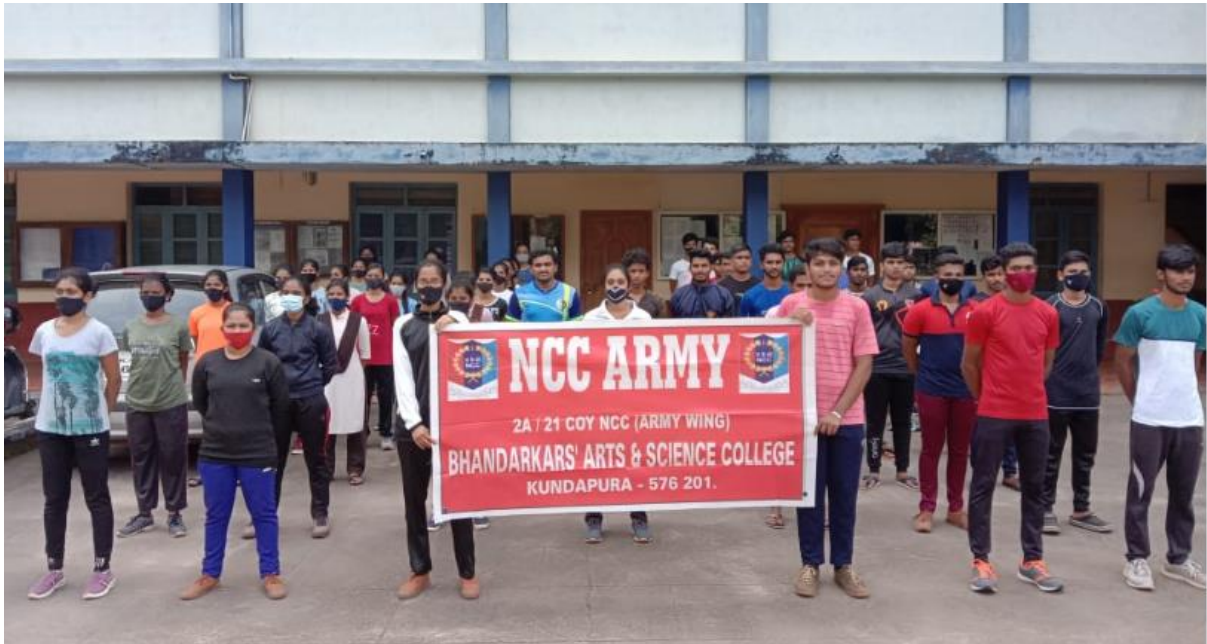
Fit India Campaign conducted on 15.09.2021.