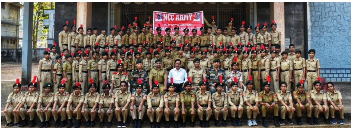
Annual Training Camp conducted in college from 23.12.2021 to 30.12.2021