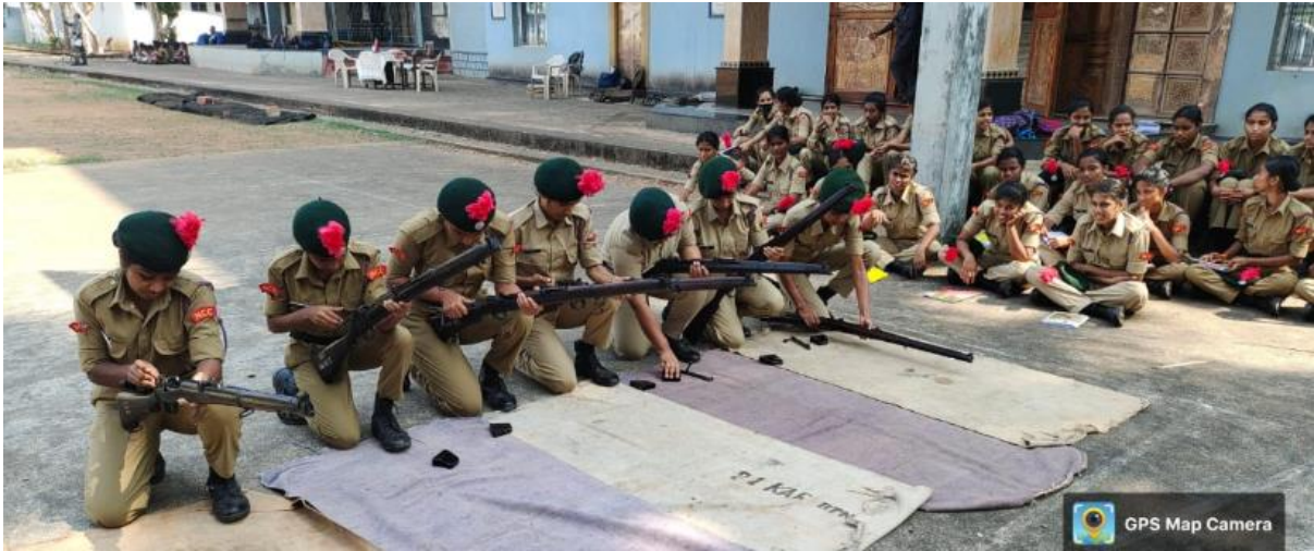
Weapon Training was conducted in the college on 15.02.2022