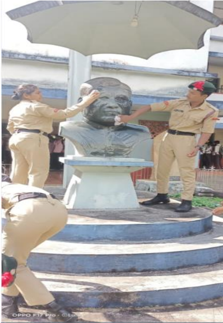
Statue cleaning was conducted in the college on 27.11.2021