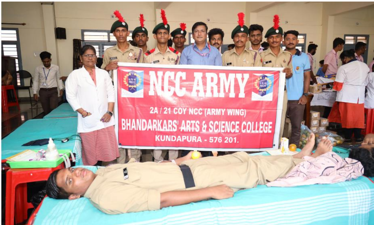
Blood Donation Camp was conducted in college, on 05.03.2022