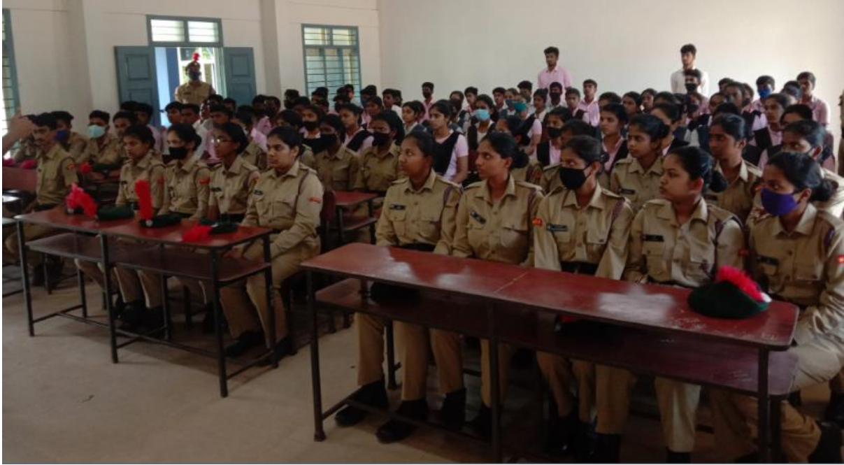
Swachhatha Awareness Program conducted in college on 27.11.2021.