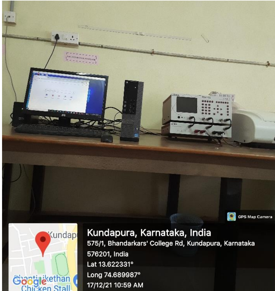
N4L Impedance Analyser