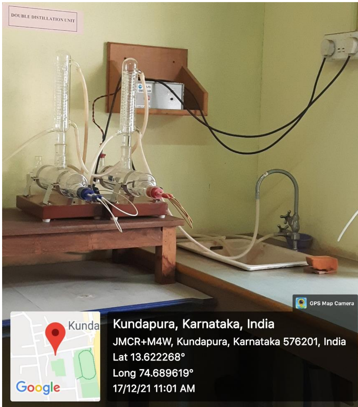
Double Distillation Unit